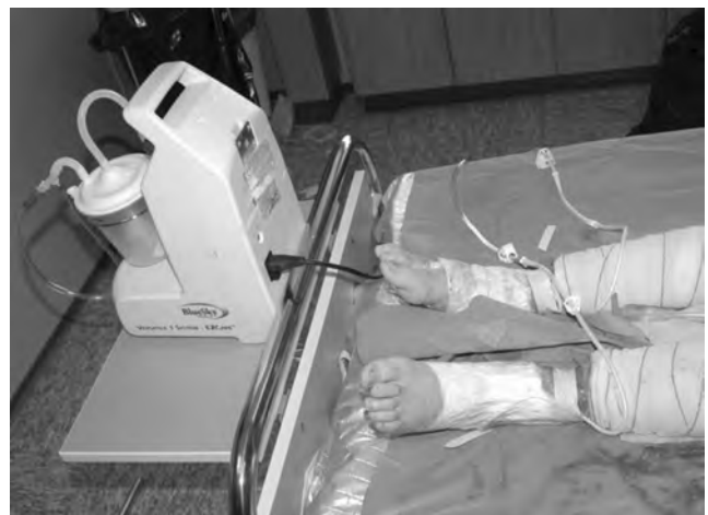
Fig. 2 - Vacuum system over Integra ® applied to both ankles.

gree burns to 50% of his total body surface area (including head, neck and both lower extremities), severe lid burns and smoke inhalation. He required prophylactic intubation and escharotomies of the lower extremities ( Figs. 1A, 1B ).