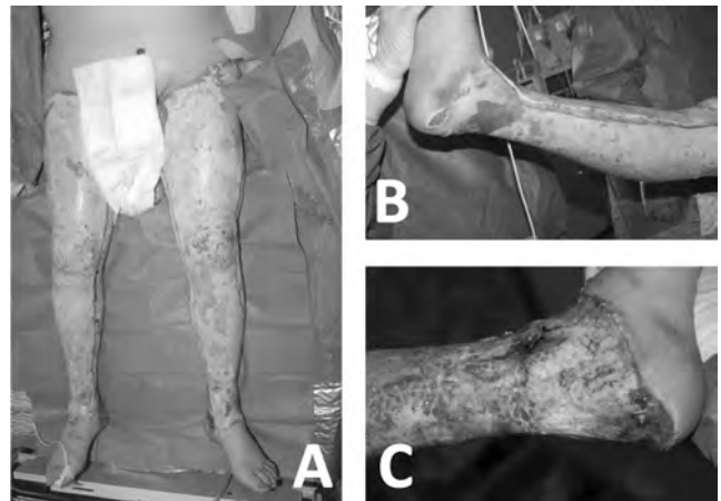
Fig. 1 - (A) Burn on lower extremities with escharotomies performed. (B) Detail of burn on right internal malleolus. (C) Necrosis of soft tissues of left ankle.

A 60-year-old man with no pathological-medical history of interest was referred to us from his local hospital after suffering flame burns provoked by an ethylene gas explosion in his workplace. The patient had suffered third-de-