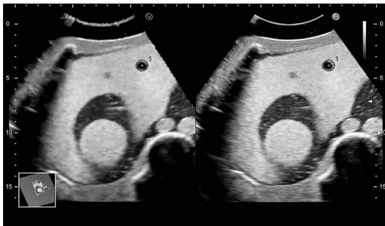
FIGURE 1. RVS synchronization using 3DUS data from a phantom model. US-MPR images from the 3D data (left) and real-time US images (right) are synchronized on the same US monitor. Furthermore, synchronized spherical markers (+, the center of the spherical marker) are displayed along the contour of a spherical structure of the phantom model on synchronized US-MPR and real-time US images.

To verify whether CEUS and RVS using 3DUS data could be applied to assess the effects of RFA on HCC, an operator (N.T.) with 20 years of experience in performing US examinations used 3DUS data from a phantom model (Model 057 Triple Modality 3D Abdominal Phantom; CIRS, Norfolk, USA) that contained structures representing abdominal organs to conduct an RVS synchronization experiment. The operator performed a manual sweep scan with a US machine (HI VISION Preirus; Hitachi Medical Corporation, Tokyo, Japan) and a convex probe (EUP-C715; Hitachi Medical Corporation) at an arbitrary site on the surface of the phantom model. The scan time was set for 15 s. The 3DUS data sets were automatically generated and manually stored on the hard disk of the US machine. Immediately after storage of the 3D data, the same site was scanned and examined to determine whether US-MPR images from the 3D data were synchronized with real-time US images on the same US monitor. The US machine had a marking function that automatically displayed synchronized straight and spherical markers on US-MPR and real-time US images, respectively. The size of a spherical marker was designed to change inversely with the distance between the center of the marker and scanning section. Then, the operator drew a spherical marker