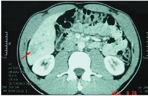
Figure 1. Computed tomography (CT) scan showing the Neoplasm (~3.5x4.5x4.5 cm) in the right lobe of the liver, as indicated by the arrow.