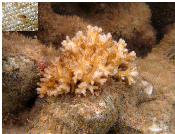
Figure 1. A Pocillopora damicornis colony on the reef in front of the Gump Research Station in Moorea, French Polynesia. The small insert shows a P. damicornis larvae on a mesh collection filter (100 µm).

In January 2010, 23 P. damicornis colonies (Fig. 1) were collected from fringe and back reef sites on the north shore of Moorea, French Polynesia. Colonies were transported to the Gump Research Station and kept in large seawater tanks (approximately 5 m 3 ). A small nubbin (1 cm) was sampled from each colony and preserved in Guanidinium-Isothiocyanate (GITC) buffer for genetic analysis. Three days before the new moon (January 15th and February 13th), colonies were transferred to individual containers with continuous seawater inflow. The outflow of each container was diverted into a short PVC tube with a mesh filter (100 µm), where the larvae accumulated during planulation (Fig. 1). Larvae were collected using a 1000-µL micropipette and preserved individually in 200-µL GITC buffer (Fukami et al. 2004). Between January 17 and 20, colonies were monitored throughout the night from 19:00 to 06:00 h and larvae were collected and preserved as frequently as possible (i.e., every 2–3 h). In February 2010, planulation lasted from February 14 to