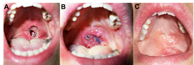
Figure 4 Iatrogenic soft palate lesion. (A) Iatrogenic soft palate defect. (B) Reconstruction with local mucosal flap and application of advanced medication. (C) Total recovery of the palatal defect.

Hyaluronic acid benefits epithelial regeneration and has free radical scavenging properties. 15 Hyaluronic acid medications are physically coupled with a transparent and flexible film of medical-grade synthetic elastomer which acts as a semipermeable barrier against external contaminants. 15 When the product is applied to the wound bed, the hyaluronic acid wound-contact layer provides a three-dimensional scaffold which enables the product to be colonized by fibroblasts and onto which extracellular matrix components are laid down,