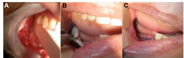
Figure 3 Bisphosphonate-related osteonecrosis of the jaw. (A) Right mandibular osteonecrosis with bone exposure. (B) Curettage and application of advanced medication. (C) Follow-up at 7 days.

modulating the release of cytokines and other mediators. 6,7,16 First isolated in 1934 from bovine vitreous humor, it was subsequently collected from other sources, such as soft connective tissues, synovial fluid, umbilical cords, and rooster combs. Hyaluronic acid is recognized by specific cell receptors such as CD44, and regulates the adhesion, growth, differentiation, locomotion, and activation of specific cell types, thereby modulating inflammation, angiogenesis, and healing processes. 6,17 Both wound size and vascularization showed good improvement in response to treatment with hyaluronic acid. 6 This may be partly explained by the effect of the degradation products of hyaluronic acid on endothelial cell proliferation, angiogenesis, and collagen deposition and organization. 6,15,17 Its structural role is attributable to its hygroscopic properties which allow for hydration and modulation of the cellular microenvironment. For these reasons, it is easy to understand the important role of hyaluronic acid in tissue repair processes, and how it contributes to the orientation of the fibrous component of the extracellular matrix.