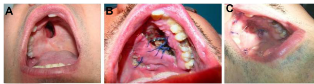
Figure 1 Post-traumatic palatal defect. (A) Outcome of massive trauma with a large residual palatal defect. (B) Reconstruction with palatal flap. Note a mucosal growth after advanced medication on follow-up at 7 days. (C) Total obliteration of the defect.

by positive feedback in the expression of protease genes, increased activation of extracellular latent protease, or by reduction of the activity of protease endogen inhibitors; this manifests as an increase in extracellular proteolysis, with greater imbalance in tissue destruction. 11–13 Collagen and oxidized regenerated cellulose, components of advanced medications, are an optimum substrate for proteases, which are bonded and cannot interact further with the tissue. 1