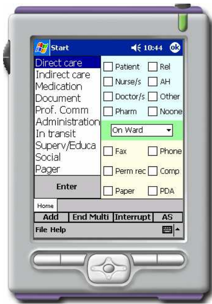
Figure 1. WOMBAT version 1.0 PDA data collection tool

the task and what information resource, if any, is used. Mutually exclusive definitions of each work task have been prepared and those developed for nurses 10 , doctors 11 and pharmacists 12 work have been detailed elsewhere.