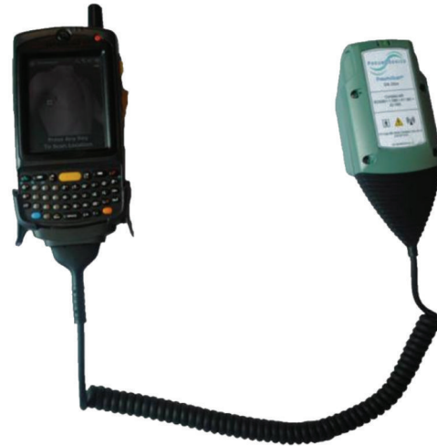
FIGURE 1: PneumoScan device.

2.2. Study Procedure. Between May and June 2011, 24 severely injured adult patients with blunt or penetrating chest trauma, admitted via shock trauma room, were included in the survey in a level-one trauma centre. Treatment was standardized