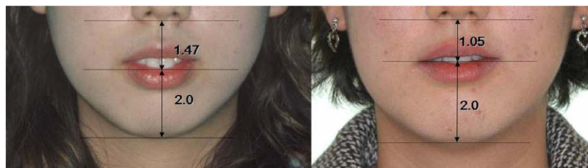
Figure 5 Pre- and post- treatment frontal lower third profile comparison.