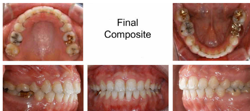
Figure 4 Post-treatment intra-oral Photographs.

The advances in the utilizing bone anchorage such as retro-molar implant (Roberts et al., 1990), onplants (Block and Hoffman, 1995; Armbruster and Block, 2001), palatal implants (Wehrbein et al., 1996a,b), mini-plates (Umemori et al., 1999), mini-screws (Costa et al., 1998) and mini-implants (Kanomi, 1997) make it possible to overcome previous limitation of orthodontic tooth movement and perform en masse movement in the desired direction. These armamentariums are becoming part of the orthodontic appliance system. As shown in the reported case, the use of mini-implants provided absolute anchorage for the desired tooth movement. Consideration has been made in placing the implant in a higher position