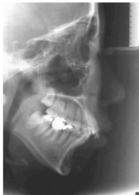
Figure 2 Pre-treatment lateral cephalogram.

After the extraction of all first bicusps, fixed pre-adjusted Bi-Dimensional Edgewise appliances were used (i.e., 0.018 \times 0.022