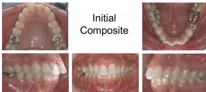
Figure 1 Pre-treatment intra-oral Photographs.

A Class I molar and canine relationship was established bilaterally. Ideal overjet (2 mm) and overbite (1 mm) was also