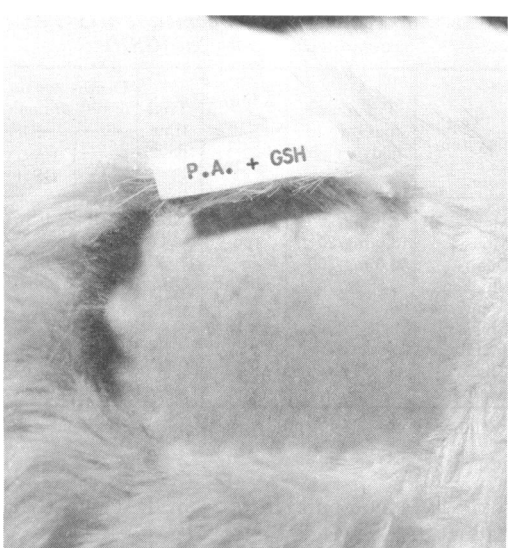
Fig. 2. Rabbit skin test illustrating nontoxicity of the penicillic acid (PA) plus glutathione (GSH) adduct.

simplicissimum. The amount of toxin produced by the various isolates on YES medium generally was not large and averaged between 4 to 10 mg/100 ml of medium. However, no attempt was made to determine fermentation conditions that probably could have given higher yields, for this was beyond the purpose of our experiments.