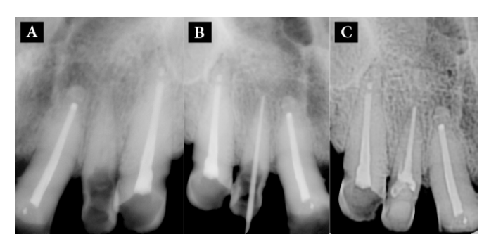
Figure 2. A ) After removal of separated instrument; B ) Negotiation of full working length of calcified root canal, and C ) Obturation

Since most stainless steel instruments fracture with excessive amount of torque, care has to be taken during negotiation and instrumentation of narrow, curved root canals. Various techniques and treatment modalities are available for instrument retrieval form root canal. This article describes a case of management of instrument separation by the use of Masserann kit [13].