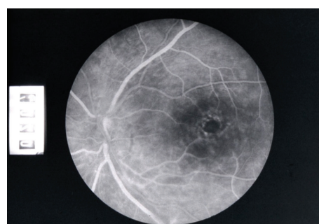
FIGURE 2: Macular edema in patients with uveitis.