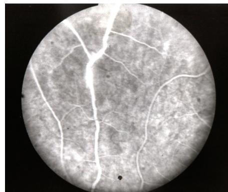
FIGURE 1: Behcet's disease, retinal periphlebitis.

Severe form of the disease was noted in approximately 71% of the cases, a significantly higher incidence in comparison to other degrees of diseases ( P = 0.0006, P \leq 0.001 ). Moderate form of the disease was present in approximately 1/3 of patients, while mild form of this disease was rarely observed (Table 6).