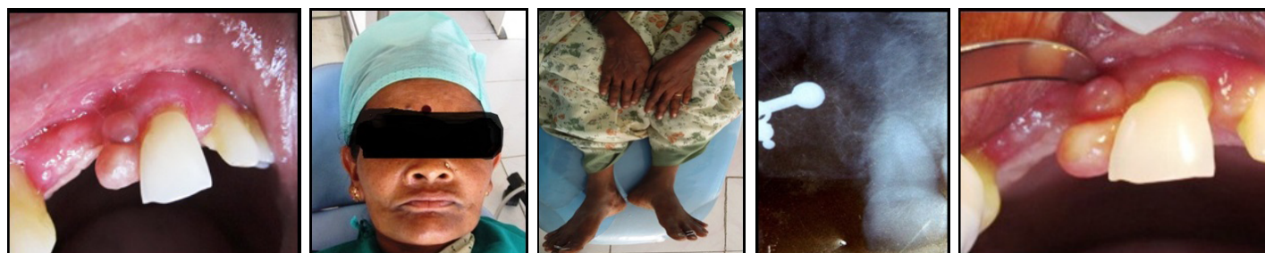
[Table/Fig-1]: Intra-oral presentation of the growth

Intra-oral radiograph was advised and did not reveal any significant feature [Table/Fig-4].