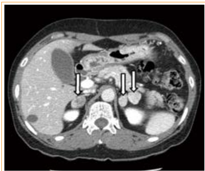
Fig. 1. Adrenal computed tomography (CT). Axial images from noncontrast-enhanced adrenal CT show a right adrenal nodule 2.8 cm in diameter, and two left adrenal nodules, 2.3 and 1.7 cm, respectively, in diameter (arrows).