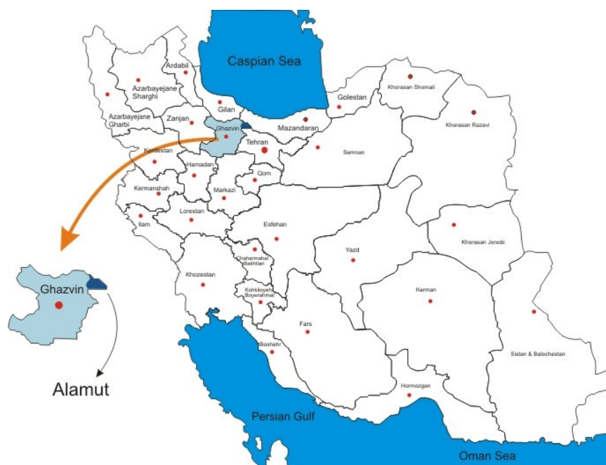
Figure 1. Study area: Iran map and Alamut in Ghazvin Province.