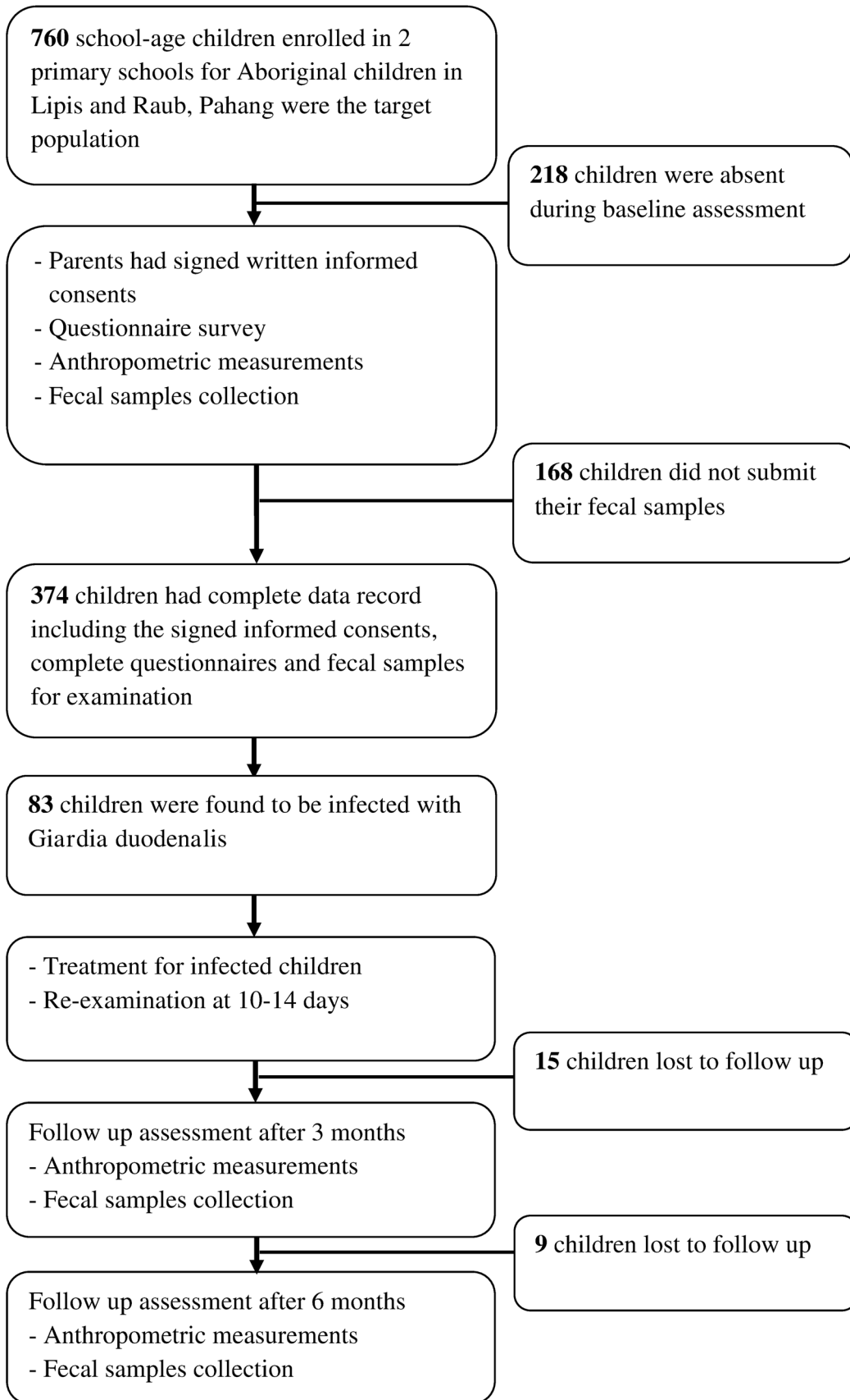
Figure 2. Flow chart of the participation and compliance in the present study. doi:10.1371/journal.pntd.0002516.g002