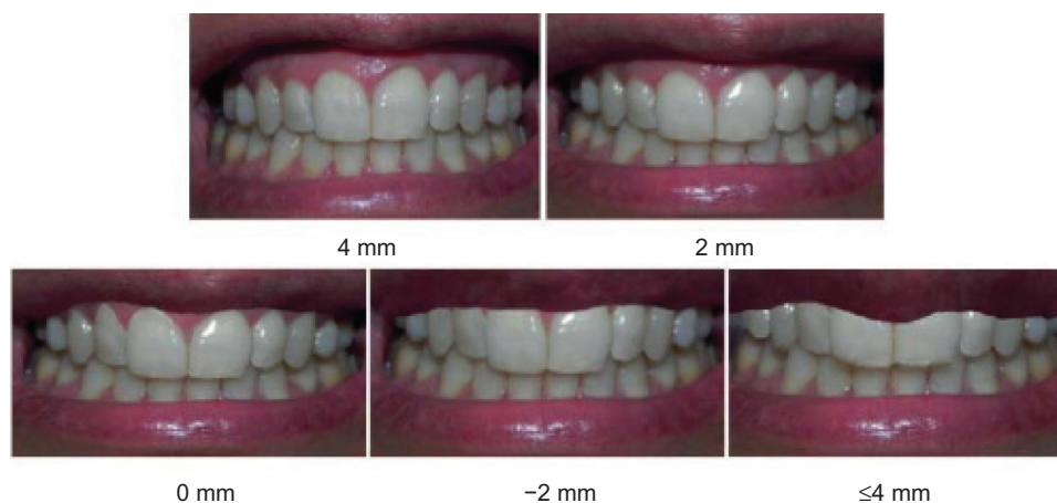
Figure 1 Gingival display.

Comparing the ratings of each smile between colleges using ANOVA, the results showed that ratings were similar in all colleges ( P>0.05 ) (Table 1).