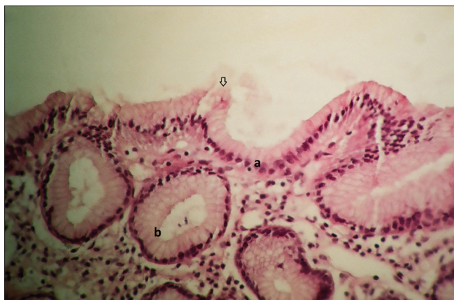
Figure 2: (a) Epithelial cells, (b) gastric gland. Arrow: Helicobacter pylori (H and E, ×200)