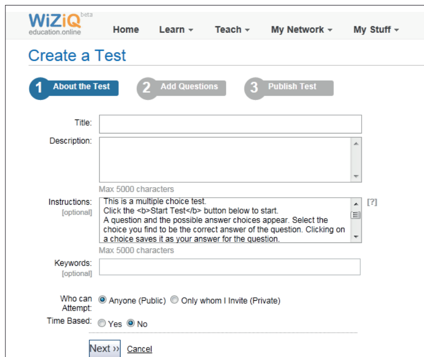
Figure 3. An example of a web page that allows creation of online courses

points and may be further punished those answers that are fundamentally flawed (for example, if you indicate that something is exactly what someone would use could be life threatening).