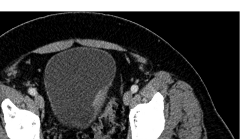
Figure 2 Demonstrates a localized mass in the posterior aspect of the bladder wall which is organ confined. There is no pelvic lymphadenopathy.

The diagnosis was therefore carcinoma in situ with an 'incidental' isolated extramedullary plasmacytoma of the urinary bladder.