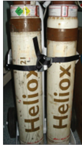
Figure 9: Heliox