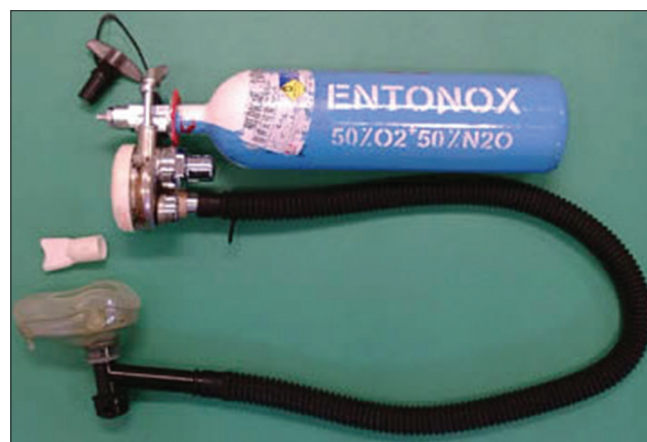
Figure 8: Entonox with delivery system

The gas mixture is delivered to patients using a two stage pressure regulator consisting of the BOC Entonox valve, the second incorporating a demand valve. This