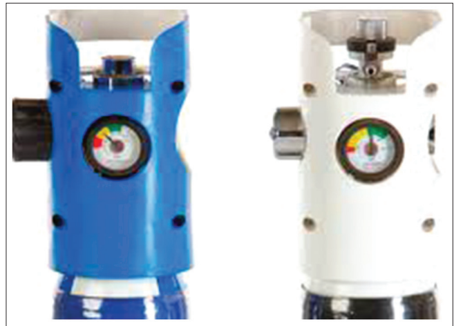
Figure 6: Integral valve