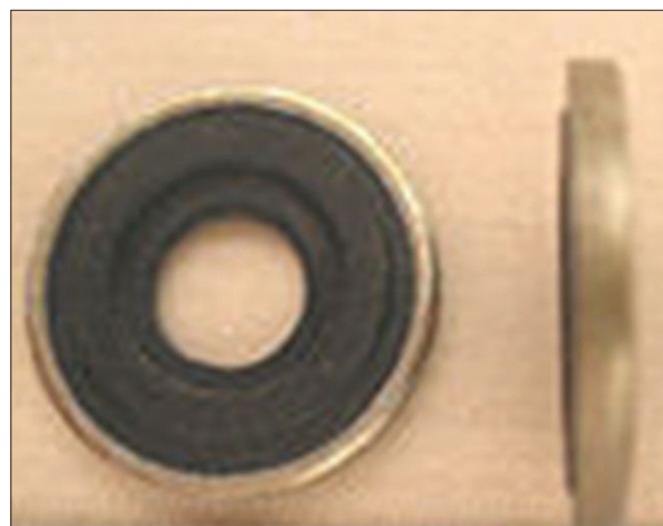
Figure 4: Bodok seal

The majority of the gases are stored in cylinders as compressed gases (oxygen, air, nitrogen, helium, heliox). These gases do not liquefy at ordinary ambient temperature regardless of pressure applied. [4] as their critical temperature is low. These cylinders are filled up to service pressure (defined as the maximum pressure