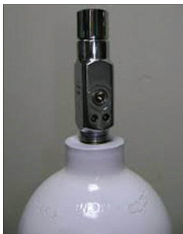
Figure 3: Pin index of oxygen cylinder

Hand Wheel valve [Figure 5] is used for N 2 O (for use on manifold) and CO 2 cylinders (size F and G). The valve may be surrounded by a protective guard. The valve has a gas specific side outlet and male thread. Bull nose and pin index cylinders require a wrench to open the valve while hand wheel cylinders do not require any additional equipment. [5,8]