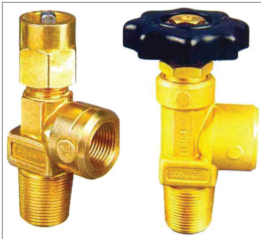
Figure 5: Bullnose and handwheel valve