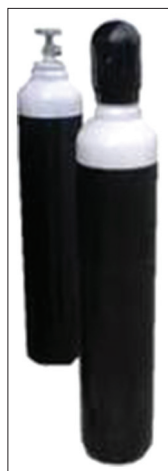
Figure 1: Medical-oxygen-cylinder with protective cap

It has a unique configuration of holes and pins which match precisely to eliminate connection of the wrong cylinder to equipment, thus prevents delivery of wrong gas to patients. [1,2,6] This system is also used by supplier to fill correct gas in the cylinder. [7] It incorporates two holes in specific positions on the cylinder valve below the outlet port [Figure 3]. The cylinder can only be connected to a yoke or pressure regulator with a matching pair of pins. The holes in the cylinder valve accept pins 4 mm diameter by 6 mm long. [2] Unless pins and holes are aligned, the port will not seal and gas will not pass to the anesthesia machine. Each gas or combination of gases has a specific pin arrangement [Table 1]. Pin index valves are fitted in small cylinders which are commonly connected directly to the anesthesia machine. Side spindle pin index valves are fitted in large cylinders of medical O 2 , air and Entonox for pipeline manifold and to F size Entonox cylinders. [1] Pin index cylinders