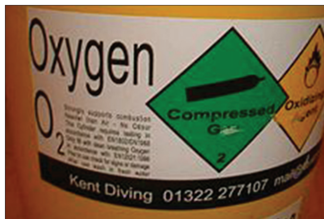
Figure 7: Oxygen cylinder label

Done in one out of 100 cylinders. The yield point should not be less than 15 tons per square inch.