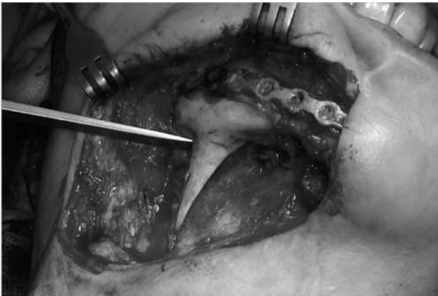
Fig. 3. Intra-operative image showing clinical aspect of ossified pedicle before surgical removal.