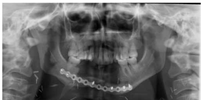
Fig. 1. Orthopantomography showing free fibula pedicle ossification of a young patient treated for oral squamous cell carcinoma.

Asymptomatic patients were also followed up. In the second group of 20 patients, we performed dissection of the periosteum from the vascular pedicle. In this group, to date, no pedicle ossification has been observed. Univariate analysis showed a statistically significant difference ( p < 0.05 ) between the two study groups. No significant increase in operative time was noted, and additional complications were not observed.