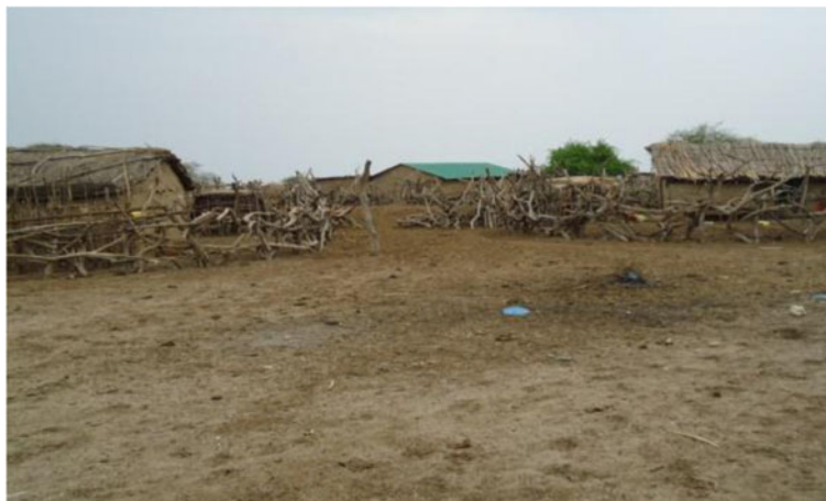
Figure 2 Representation of Maasai community village (Monic village, Ngorongoro district in Tanzania) on the Eastern arm of Rift Valley shared houses with domestic animals during the outbreak.

knew that there was a control measure currently in place that involved vaccination. The level of literacy in the study community was low due to nomadic lifestyle with 37.8% (28) being illiterate, 39.2% (29) standard seven, 5.4% (4) form four, and 1.4% (1) of the respondents being college graduates. This has an impact not only in the transmission and implementation of control strategies for RVF but also in the control of other livestock diseases.