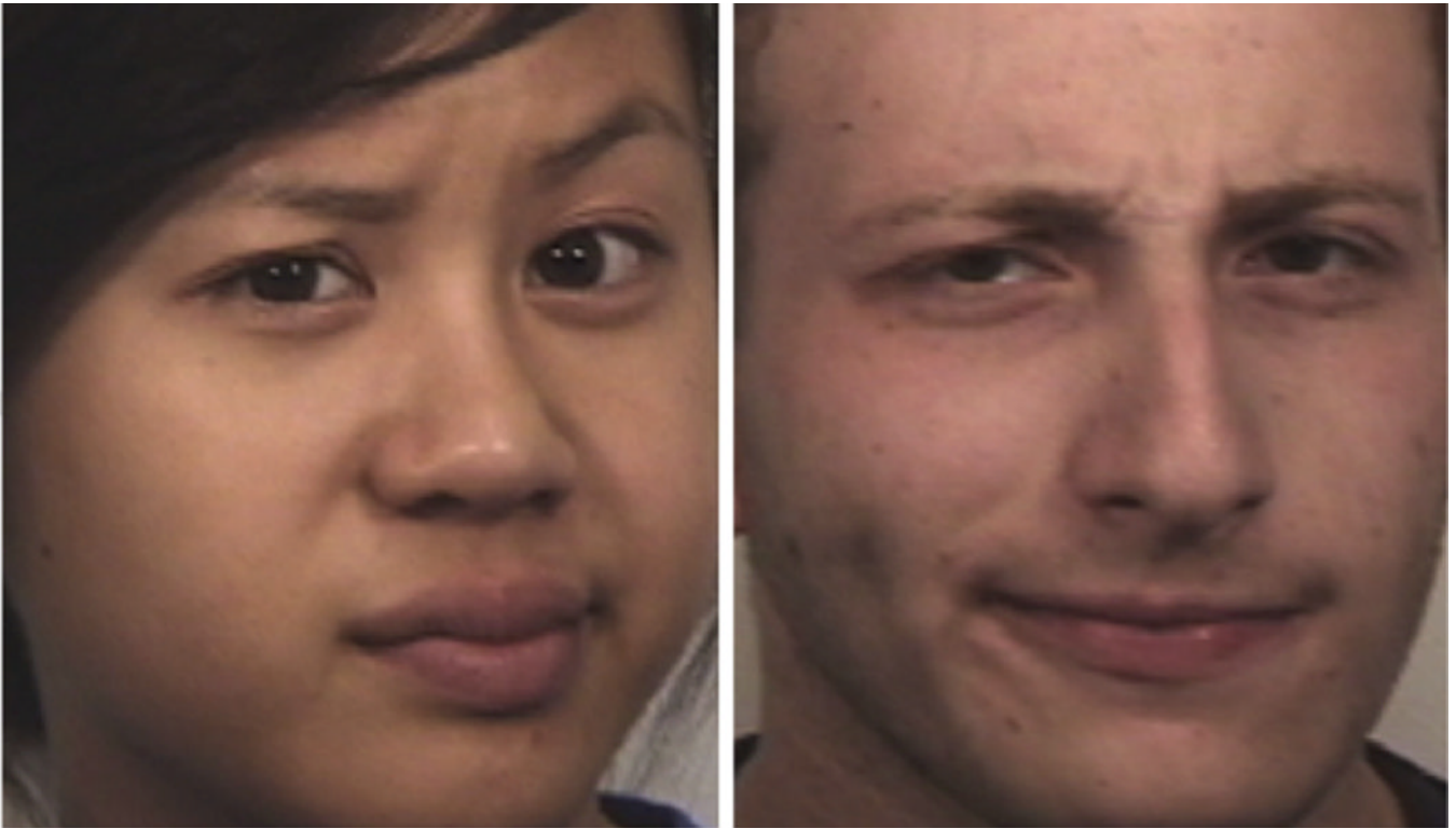
Fig. 2. Examples of disapproving facial expressions.