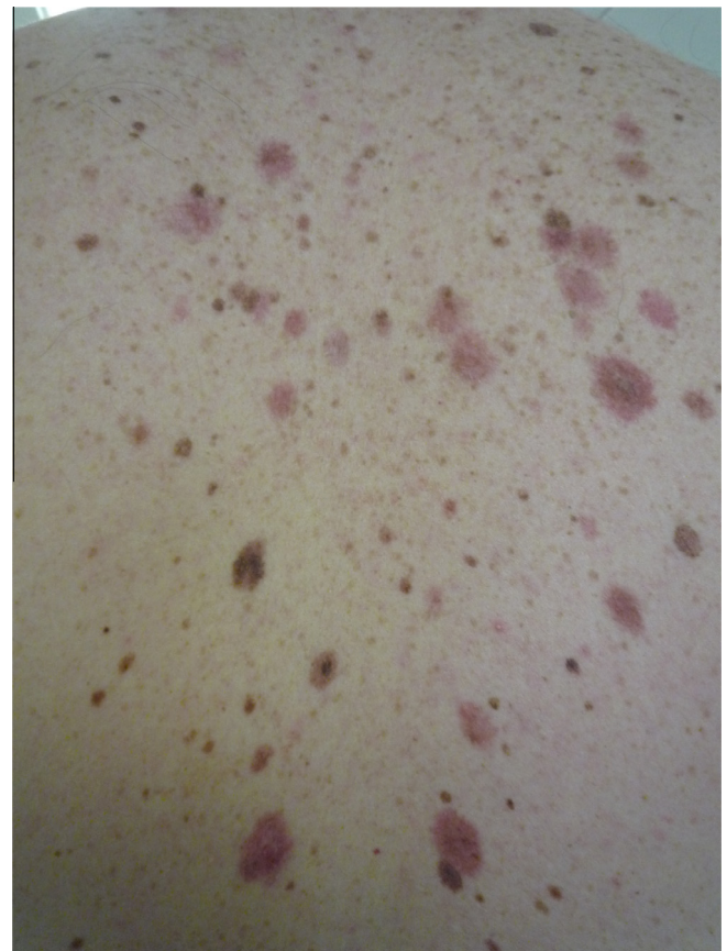
Fig. 1. The atypical mole syndrome (AMS). Naevi genetics has helped in discovering new melanoma genes but this phenotype is also helpful as it does unravel some associations between melanoma risk factors and other phenotypes such as reduced ageing and longer telomeres.

The number and types of naevi (such as atypical naevi) is the strongest risk factor for melanoma in all Caucasian populations and the magnitude of the odds ratios (5–20) is much greater than any odds ratios ever reported for sun exposure and skin colour (1.5–2) (Fig. 1) [12,13]. Naevi confer the same magnitude of risk for melanoma at all latitudes showing again that sunlight is not that important for this association [14]. Looking into the biology of naevi is likely to lead to very interesting clues regarding the pathogenesis of melanoma. Melanocytes derive from the neural crest cells and their differentiation and migration to the skin occur during embryogenesis. This involves many genes such as MITF, WNT signalling, SOX10 and SOX 9 to mention only a few [15]. Interestingly, one of these genes, MITF has recently been reported to be involved later on in adulthood in melanoma susceptibility and invasion [16,17]. BRAF somatic mutations are also very common in naevi and melanoma and this led recently to the first therapy ever conferring an increased survival in melanoma [18,19]. Bastian and colleagues have looked at genetic signatures in melanoma tumours according to histological subtypes and body sites [20]. BRAF mutated melanomas are more common on the trunk and limbs compared to head and neck tumours and this again was thought to be due to differences in sun exposure but this