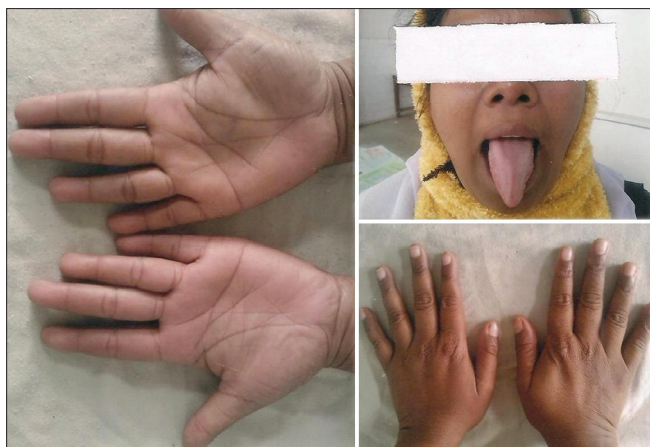
Figure 3: Post treatment reversal of hyper pigmentation after 12 weeks of vitamin B12 supplementation