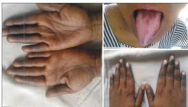
Figure 1: Hyperpigmentation before treatment