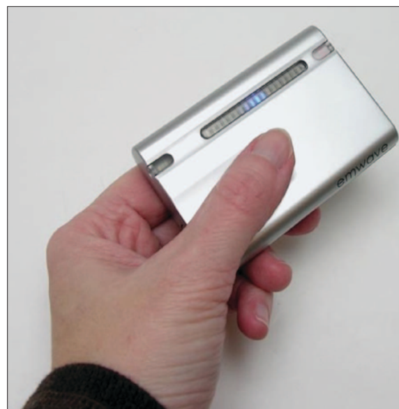
Figure 1 The emWave Personal Stress Reliever.

The sample investigated in this study was selected at random from the cardiac center registry at the Prince Sultan Cardiac Center in Hufuf, Saudi Arabia, for potential inclusion in the study. The inclusion criteria for hypertension were a systolic BP of greater than 140 or a diastolic BP of greater than 90. Sixty-two patients were recruited to participate in the study. Prior to the experiment, the examiner explained to the patients the aim of the study and the procedures they would be asked to participate in.