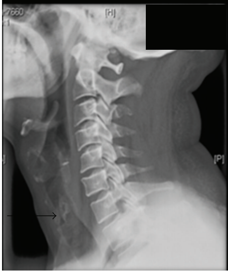
FIGURE 1: X-ray neck lateral view—radiopaque foreign body at C6-C7 level.

where a repeat rigid telescoping of the larynx showed a normal airway lumen.