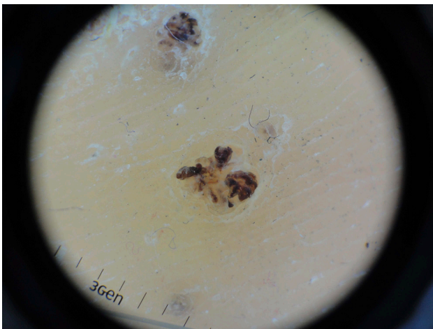
Figure 2. Thrombosed capillary loops are observed by dermoscopy. The transparent glass slide does not obscure observation of the lesion. As a mechanical barrier, it can prevent potential transmission of bacterial and viral infections.

made from standard household plastic wrap [8]. It can act as a mechanical barrier. However, the method has similar limitations as with PVC film described above.