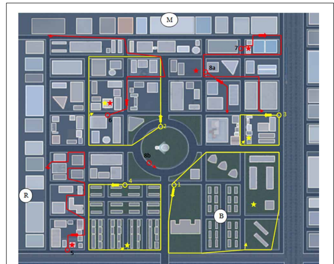
FIGURE 3 | Pre-recorded paths viewed by participants during the passive viewing of each trial. Shown is the aerial view of each path.

For all trials, participants were instructed to take the shortest route possible to find the targets. Participants were asked to confirm that they had noticed the target immediately after passive viewing in each of the trials. Targets were typically focused on for 2–3 s during path viewing. Those who failed to see the target were allowed to view the pre-recorded path a second time. For those who failed to find the target, distances travelled were measured as total distances travelled until the participant admitted being lost and gave up further searching.