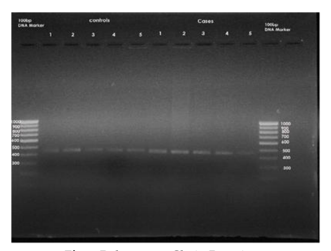
Fig 3: Polymerase Chain Reaction.

to have Non syndromic tooth agenesis were included in the study.