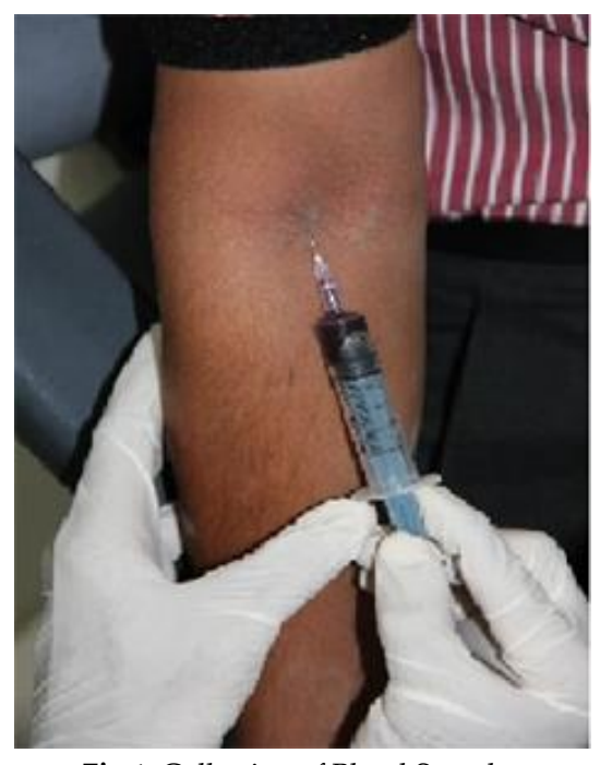
Fig 1: Collection of Blood Samples

3. Patient having any history of extractions without available records.