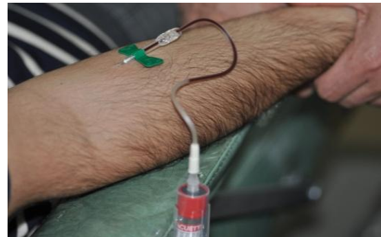
Fig 5: Taking a blood sample

depends on the speed of blood collection and transfer to the centrifuge as no anticoagulant substance is used. To produce a fibrin membrane, fluid trapped in the fibrin matrix is driven out and a very resistant autologous fibrin membrane is obtained (6).