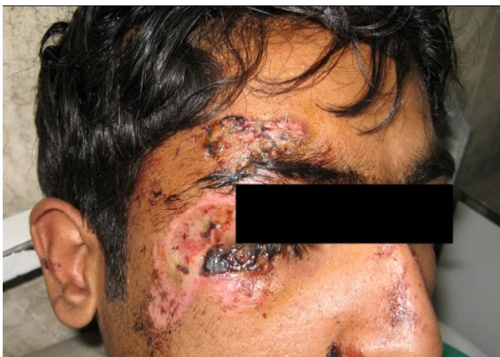
Fig 1: The avulsion area before treatment

A 24-year old man who suffered a motorcycle accident was referred to Shahid Kamyab Hospital. An examination of the subject revealed an avulsion of his periorbital skin that was 2 × 3 cm in size (Figure 1). The patient had no medical history.