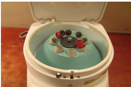
Fig 4: Table centrifuge

PRF is a natural fibrin matrix which was first developed in France by Choukroun and colleagues (5). The technique of producing PRF is very simple and needs nothing more than a blood sample and a PC-02 table centrifuge (Figure 4).