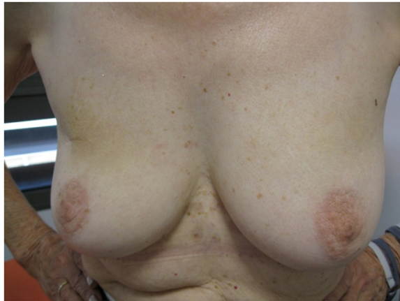
Figure 2 Photographies of patient #1 with 60 months of follow-up.

The fourth local event was a second 3-mm primary ductal carcinoma located in another quadrant and diagnosed 3 months after the surgery. The RADELEC scientific committee considered this event as a second primary tumor omitted during the preoperative staging (staged only by ultrasound).