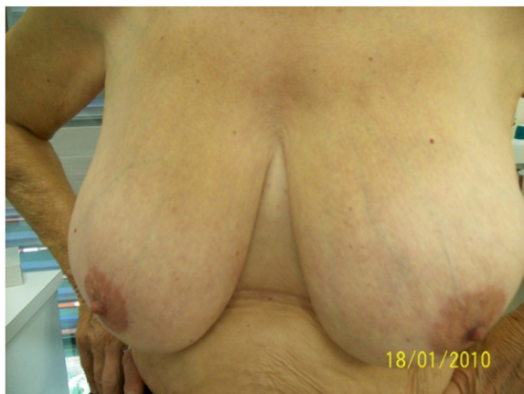
Figure 3 Photographies of patient #2 with 60 months of follow-up.

Post-treatment mammograms showed characteristic pictures of severe cytosteatonecrosis in 30 patients (71%) corresponding to a palpable mass within the IORT area for 17