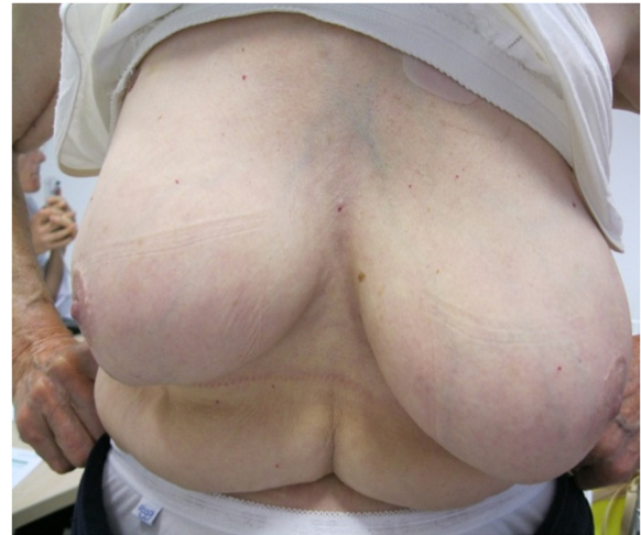
Figure 4 Photographies of patient #3 with 60 months of follow-up.

patients (40%). These structural changes in the tumor bed complicated the evaluation of mammograms within the first two years of follow-up. Two patients required non-routine procedures leading to a biopsy for pathological control. Both of them had outside institution exams.