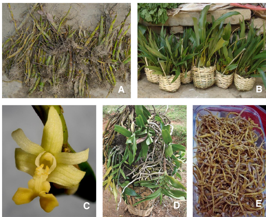
Figure 2 Trade in illegally collected medicinal orchids in Nepal. 2A. Dendrobium eriiflorum (photograph: B. Kunwar). 2B. Coelogyne species in market outlets (photograph: A. Subedi). 2C. Flickingeria fugax (photograph: A. Subedi). 2D. Aerides and Dendrobium species in traditional bamboo baskets (photograph: B.B. Raskoti). 2E. Dendrobium eriiflorum originating from Nepal in Hong Kong supermarkets (photograph: Anonymous).

Dakshinkali, 22 km from Kathmandu, is the center of wild orchid trade in Nepal, and orchids have been sold for over 25 years. Dakshinkali has at least 10 vendors that are