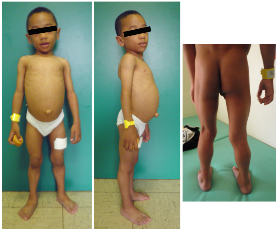
Figure 1 Photographs of our patient. Protruding abdomen, marked umbilical prominence, mild generalized loss of subcutaneous fat, and hypertrophic buttock and lower limb muscles are shown.

On sequencing the PTRF gene, a novel homozygous single base pair deletion, c.947delA was found (Figure 3D); the same mutation was present heterozygously in each