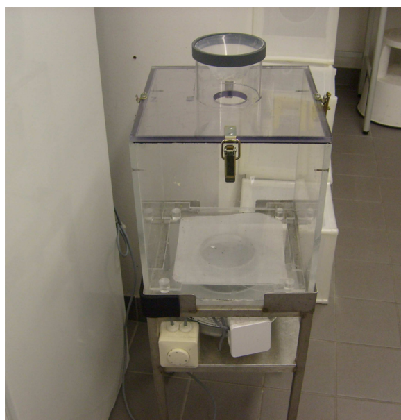
Figure 2 Suction device with adjustable fan speed for drying eggs.

above. All cups were placed in a temperature-controlled rearing room at 27°C for hatching.