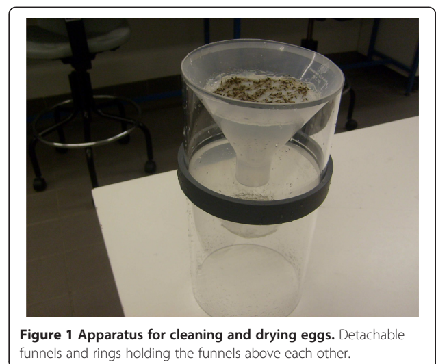
Figure 1 Apparatus for cleaning and drying eggs. Detachable funnels and rings holding the funnels above each other.

The lower portion of the apparatus with the funnel and clean eggs was detached and placed over a suction device with adjustable speed (Figure 2). The wind speed and drying duration were adjusted so that all eggs dried and no clumping was apparent. Three wind speeds (1.0, 1.8 and 3.0 m/s) and four drying durations (10, 15, 20 and 25 min) were tested. Wind velocity was measured using a Testo 417 anemometer (Testo Ltd, Alton, UK). For each combination of wind speed and drying duration, three replicates of 200 eggs were used. At the end of each treatment, eggs were placed in cups lined on the inside with 2.5-cm-wide filter paper strips and containing 40 ml deionized water (providing 1 cm water at the bottoms of the cups). The tops of the cups were covered by placing a tray over them to reduce evaporation. Control eggs were taken directly from the filter paper in egg cups and divided into three replicates of 200 eggs as described