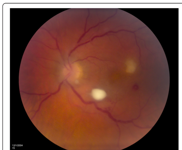
Figure 1 Endogenous fungal endophthalmitis caused by yeast.

Patients with endogenous endophthalmitis caused by molds were diagnosed significantly closer to onset of symptoms (Table 3, p = 0.002). While there was no significant difference between the groups in terms of the type of intraocular inflammation noted by the initial treating physician, patients with positive mold cultures were significantly