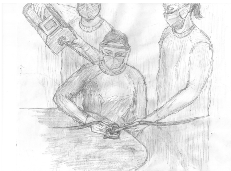
Figure 1 Experimental setup.

ear-loop mask (3 M™ ESPE™ Ear Loop Face Mask, 2000 F) was placed over the intake nozzle of the Jerome analyzer. The mask was replaced after every two mercury vapor concentration recordings. As recommended in the instruction manual, the Jerome analyzer was regenerated on the morning of each data collection day, at the end of each day, and when the Jerome display indicated that regeneration was necessary during the data collection process. Thirty minutes after regeneration, the analyzer was calibrated and then used to collect data. Mercury vapor readings were taken at an average distance of 38 cm from the dental jaw simulator implanted with the amalgam-filled plastic teeth, with the nozzle of the Jerome analyzer pointed directly towards the working area from a superior position, thereby mimicking the position of a dental student's face during amalgam removal. The distance of 38 cm was determined to be the average distance from the face of the drill operator to the operative site.