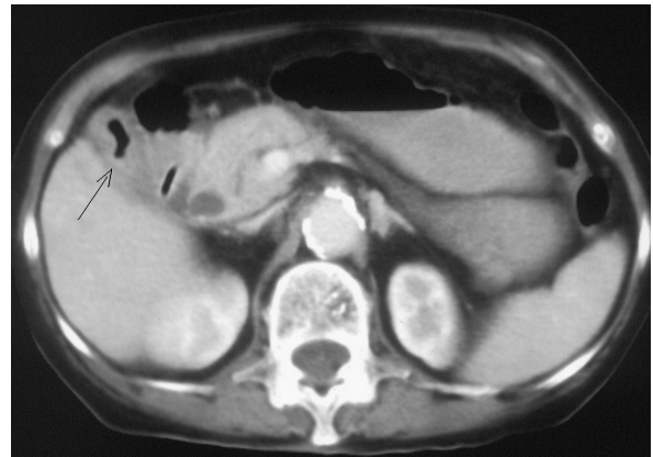
Figure 3 CT scan case 1: Gallbladder with thickened walls and with hydrogaseous levels.

gallstone; the patient is taken to the surgery theatre for the emergency laparotomy. A pararectal right-side incision is made; once the peritoneum is opened, many adhesions around gallbladder are visible and we proceed with the adhesiolysis and with the exploration of abdominal organs, that are free of neoplastic lesions. We identify a gallbladder-duodenal fistula, a diverticulum at about 70 cm from the ileocecal valve and a large gallstone formation at ileocecal valve level; we proceed with the enterotomy, with gallstone removal and diverticulum resection with TA. The post surgery course is normal, without complications, with regular discharge from hospital on day 13 after surgery. The patient enjoyed good health for one year and, after 20 months from the surgery, died because of heart disease.