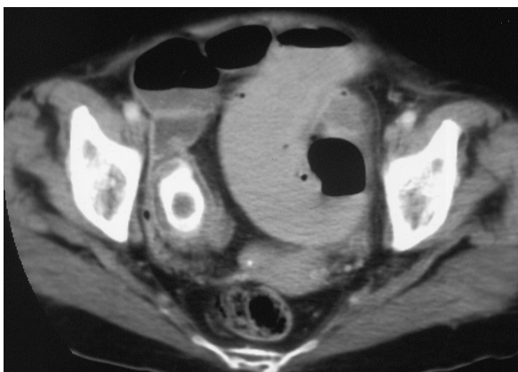
Figure 2 CT scan case 1: The gallstone is clearly detectable within the lumen of ileus.

examination, abdomen is aching when both deep and surface palpation to upper quadrants are carried out, and some pings (metallic noises) can be heard on auscultation. Blood test does not show significant alterations. An x-ray of the abdomen is performed in urgency and highlights the presence of multiple air-fluid levels; in order to achieve a better knowledge of the patient's situation, we decide to perform abdomen and pelvis TC with contrast which shows the classic triad of gallstone ileus: hard gallbladder, intestine loops distension and air-fluid levels, presence of gallstones in jejunum loops lumen (Figure 4). We decide for urgent surgery; through midline laparotomy we explore the peritoneal cavity and find the dilatation of jejunum-ileal loops that is due to an obstructing gallstone located approximately in the middle of ileum. We proceed cautiously to a mobilization in cranial direction and to ileotomy in healthy bowels, gallstone extraction and following ileotomy suture with