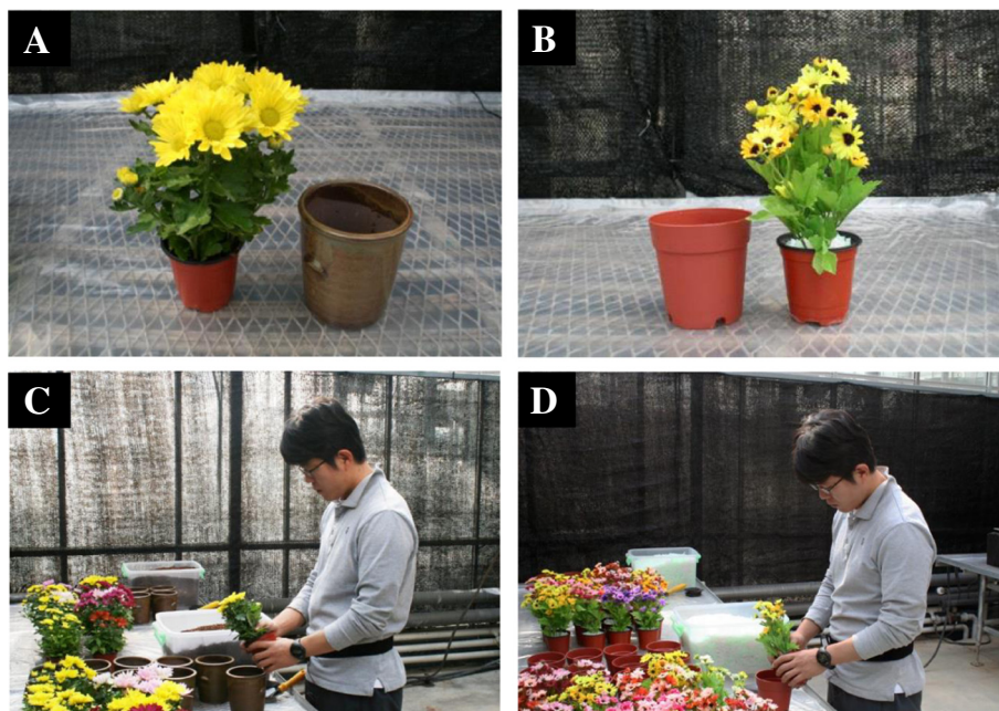
Figure 1 Photographs of materials used in experiments. (A) Real flower ( Chrysanthemum ); (B) artificial flower; (C) a subject doing horticultural activity; (D) a subject doing control activity.

Participants were randomly divided into two groups. On the first day of experiments, the first group (N = 8) carried out horticultural activity, while the second group (N = 8) performed the control activity. On the second day, each group switched activities as a crosscheck.