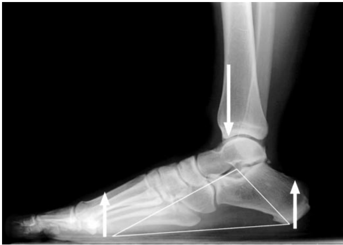
Figure 1. The triangle shows the truss formed by the calcaneus, midtarsal joint, and metatarsals. The hypotenuse (horizontal line) represents the plantar fascia. The upward arrows depict ground reaction forces. The downward arrow depicts the body's vertical force. The orientation of the vertical and ground reaction forces would cause a collapse of the truss; however, increased plantar-fascia tension in response to these forces maintains the truss's integrity.

mechanical stresses placed on the plantar fascia. Such information is important clinically because it may provide health care professionals with a clear understanding about the relationship between abnormalities and biomechanical influences. 14–16 A clear understanding of these principles will enhance the decision-making process involved in the evaluation and treatment of patients with plantar fasciitis. 20