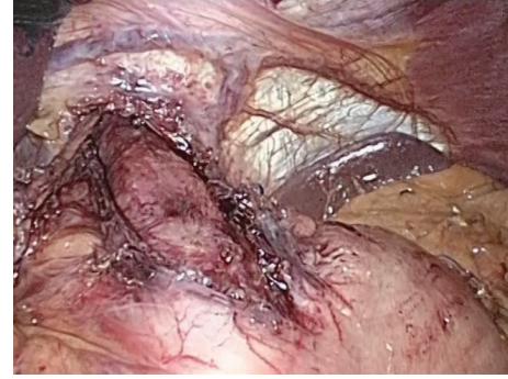
FIGURE 2: Myotomy extent proximal and distal to the LES.

incidence. This difference could be attributed to the fundoplication routinely performed in the laparoscopic group. There are no differences in postoperative complications between these surgical options, but laparoscopy has shown to reduce hospital stay, have less bleeding, have lower analgesic use, and allow for shorter time of return to normal activities. Therefore, laparoscopic myotomy is now considered the surgical procedure of choice for treating achalasia.