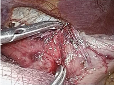
FIGURE 1: Blunt dissection for myotomy.