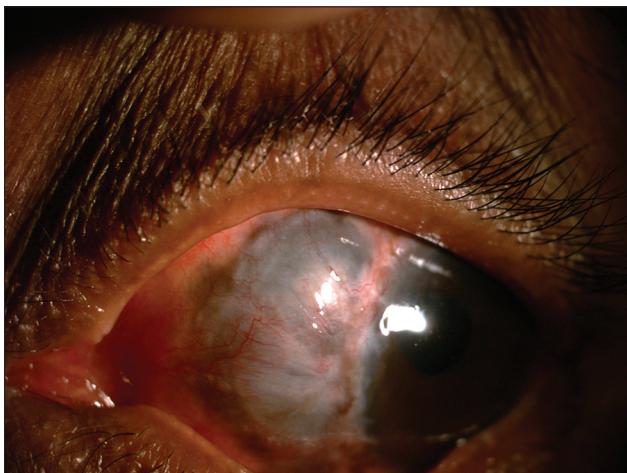
Figure 3: Six months after corneo-scleral patch graft following infectious scleritis post-cataract surgery (Case 8)

abscesses ( P = 0.209 ). The addition of surgical intervention did not result in a significantly better visual outcome than medical management alone ( P = 0.209 ), but resulted in a higher rate of globe preservation ( P = 0.045 ).