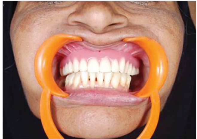
Figure 4: The new denture was fabricated after one month