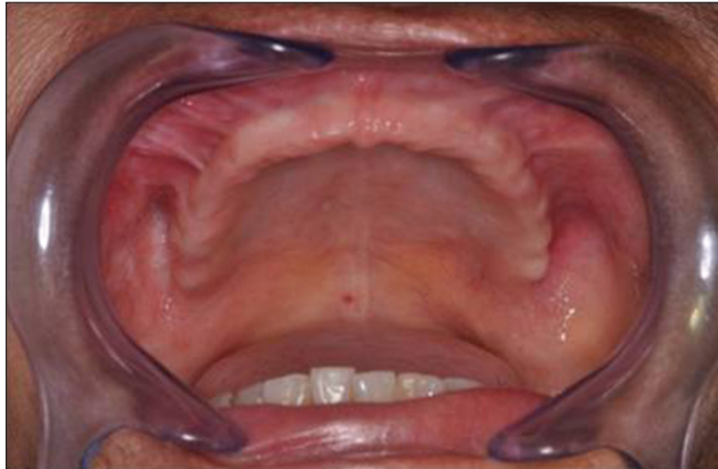
Figure 5: Regular follow-up and there were no recurrence

the full length of the maxilla after reviewing the patient for any medical condition. The tissue was infiltrated with local anesthesia containing adrenaline 2% and posterior superior alveolar, infraorbital and greater palatine nerve blocks were given. Using a no. 15 surgical blade an outline for resection in a wedge shape was made along the length of the lesion. The resection was then carried out from the midline till the posterior tuberosity region. Hemostasis was achieved. The field was cleaned with betadine and saline solution. A primary closure was achieved using 3-0 vicryl suture material [Figure 2]. Postoperatively, antibiotics and analgesics were prescribed. The patient was instructed not to wear the denture and rinse