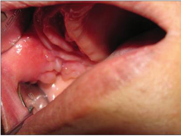
Figure 1: Multiple hyperplastic tissue folds in the right maxillary buccal vestibule