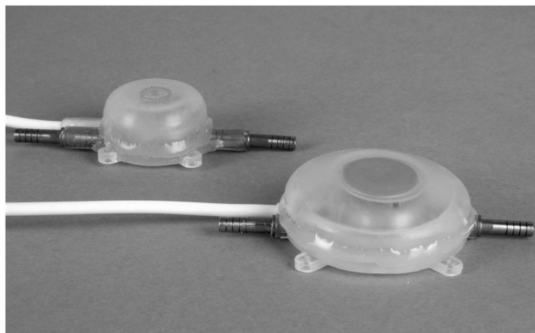
Figure 3 Valve after revision (right hand side) compared to the old one (left side).

The study is of descriptive nature. The results reflect the experiences with this new artificial bowel sphincter device. The data were collected uniformly and prospectively. Although the results are compared with published data for the well-studied Neosphincter, general statements can not be made about an advantage or inferiority of the AAS.