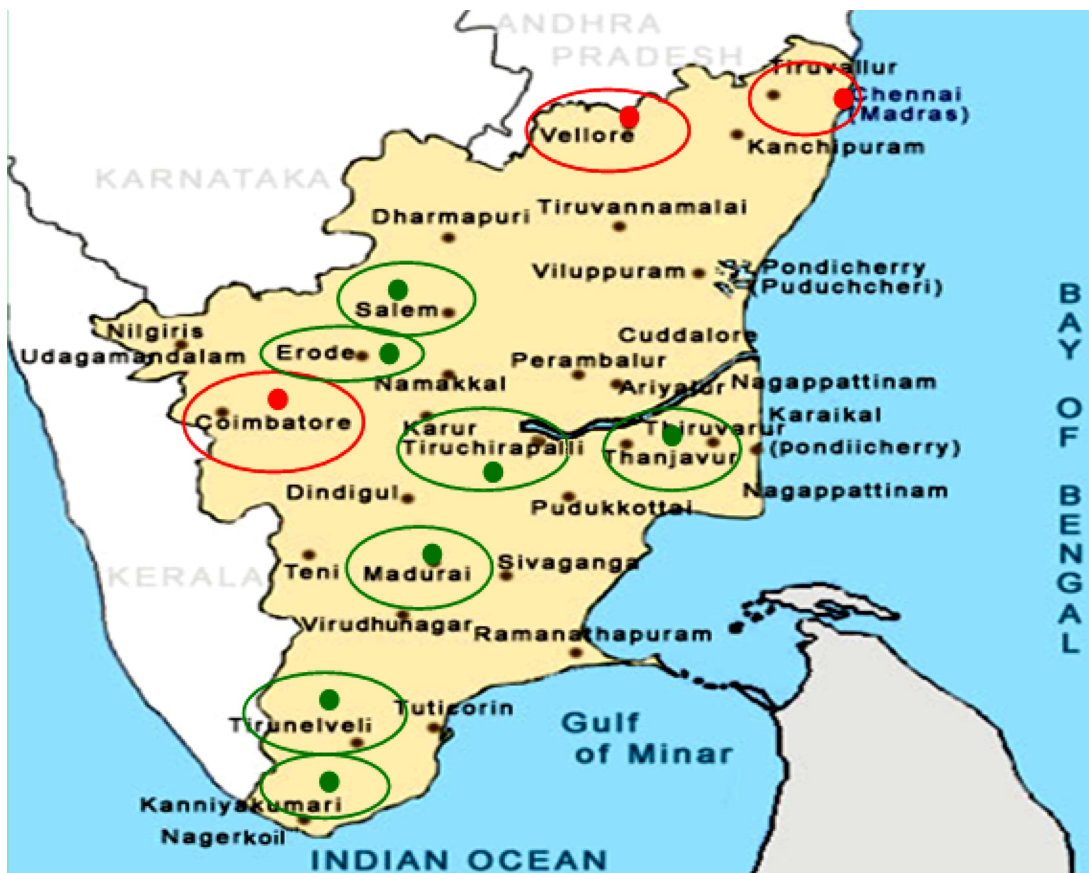
Figure 2 Geographical location of ST-elevation myocardial infarction clusters in the state of Tamil Nadu.

India; to help organise and train STEMI teams in hospitals; and to develop STEMI systems of care appropriate to the context of healthcare systems'