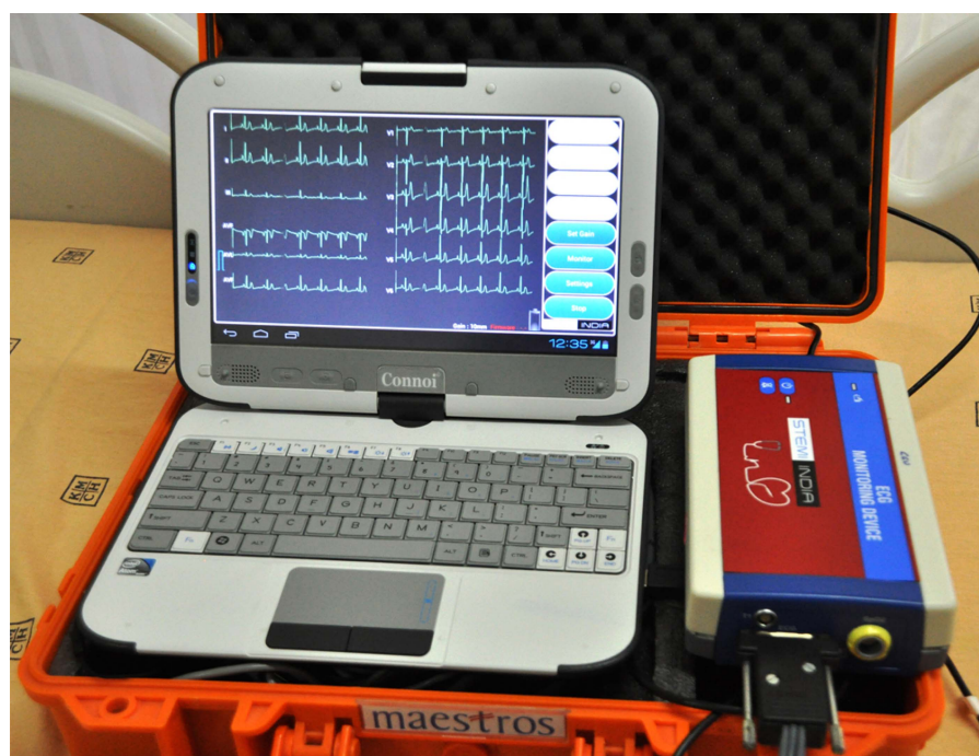
Figure 3 ST-elevation myocardial infarction kit.

The paramedic and STEMI coordinators will capture the patient demographic details along with a checklist for eligibility for fibrinolytic therapy. This information along with the ECG will be transmitted to the on-call cardiologist in that cluster to diagnose STEMI and decide on initial treatment. The on-call cardiologist receives an alert once these data are obtained. She (or he) can then go over the patient records, ECG and confirm STEMI. This in turn alerts the paramedic to transport the patient to the destination based on GPS navigation. A dedicated server will be available round the clock to route all information from one hand-held device to the other in ambulance or hospital. Data are simultaneously stored on the server along with the ECG snapshot which can be accessed by teams at the receiving hospital.