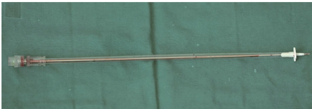
Figure 3 Long cannula used for antegrade cardioplegia administration and venting. The cannula is inserted into the ascending aorta or the aortic root under direct vision.