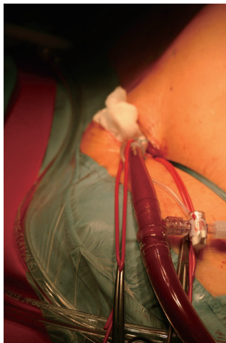
Figure 2 Cannulation of the right axillary artery is an alternative approach to direct cannulation of the femoral vessels or the ascending aorta.

Antegrade crystalloid cardioplegia [Custodial-histidine-tryptophan-ketoglutarate (Custodial-HTK) Brettschneider; Koehler Chemie, Alsbach-Haenlien, Germany] has been used for many years and its safety and efficacy have been established in experimental and clinical studies (9). It is