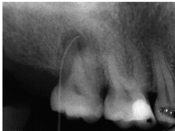
Figure 4. Tracing radiograph shows the origin of lesion is endodontic