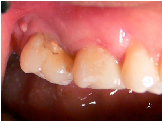
Figure 1. Intraoral view of the fused second maxillary molar and a parulis