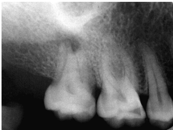
Figure 2. Preoperative radiograph demonstrated periapical radiolucency and abnormal roots