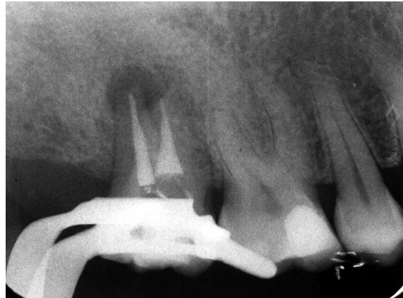
Figure 7. Postobturation radiograph