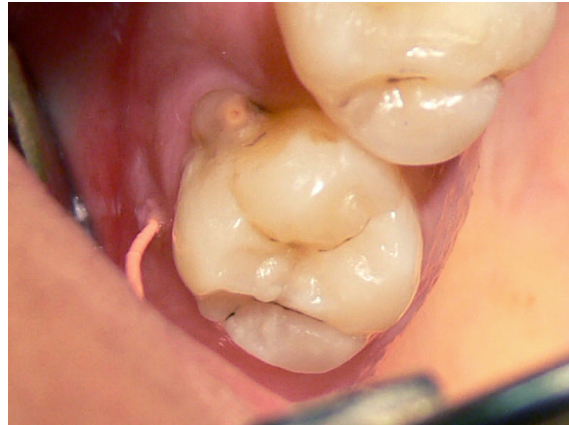
Figure 3. Occlusal view of fused teeth and traced gutta-percha placed in the sinus tract