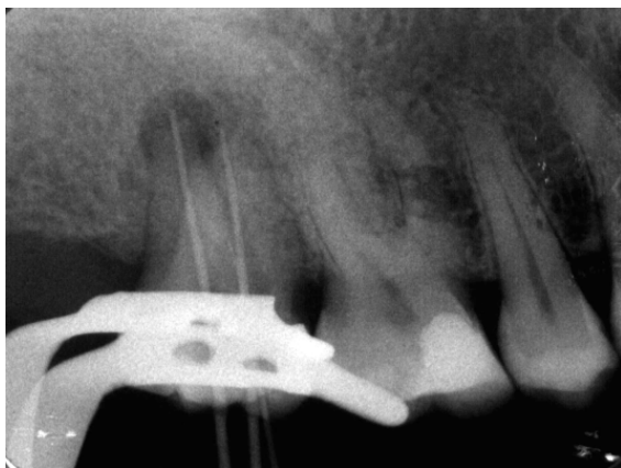
Figure 6. Master cone confirmation X-ray