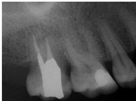
Figure 8. Recall radiograph revealed complete healing of periapical lesion

Milford, DE, USA) (Figure 7). A postoperative radiograph revealed densely condensed root canal fillings in the two canals. The crown was then restored permanently with amalgam.