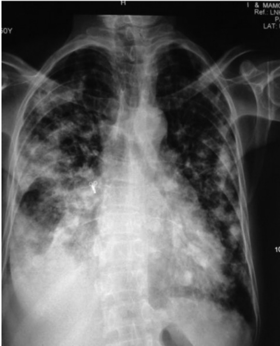
Fig. 1 – Chest X-ray reveals right-sided pleural effusion with multiple nodular opacities in both lung fields. Consolidation of right middle lobe also noted silhouetting right heart border.

developed progressive breathlessness and pedal edema with further episodes of hemoptysis. A cardiac referral was sought from our centre for the above complaints.