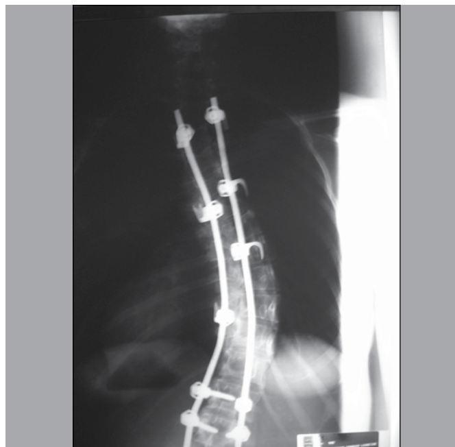
Figure 1. PA radiography of postoperative spinal column of patient IBF 1.

The genotyping of the I/D polymorphism of the ACE gene was conducted using a system of 2 specific primers (Primer ACES 5'-CTGGAGACCACTCCCATCCTTCT-3'), (Primer ACE-AS 5'-GATGTGGCCATCACATTCGTCAGAT- 3') that open the