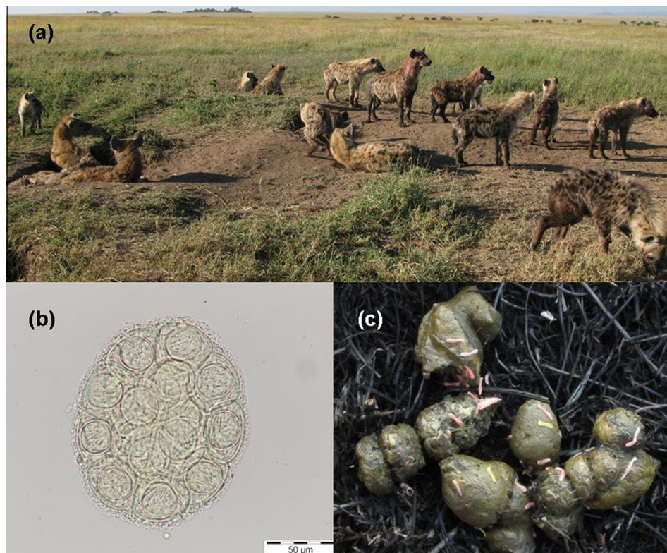
Fig. 1. (a) A spotted hyaena communal den. (b) Dipylidium sp. egg capsule obtained from a gravid proglottid collected from a spotted hyaena faeces. (c) Spotted hyaena faeces with Dipylidium proglottids present on the surface.

Female spotted hyaenas with high social status have priority of access to food resources in their clan territory (Kruuk, 1972; Frank,